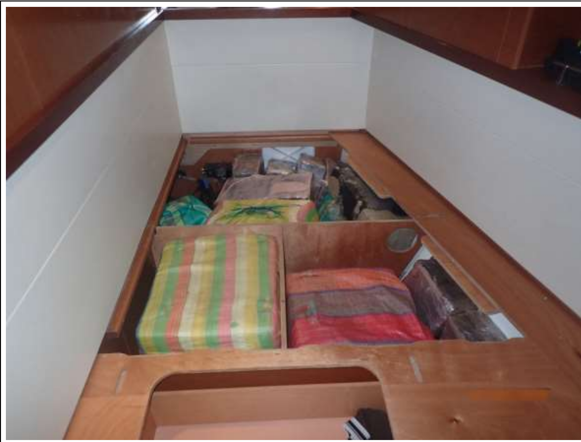
Bales of cocaine lie within compartments aboard a sail boat interdicted by Coast Guard Cutter Steadfast crew members during the cutter's counter-drug patrol in international waters of the Eastern Pacific Ocean, June 3, 2019. The Coast Guard increased U.S. and allied presence in the Eastern Pacific Ocean and Caribbean Basin, which are known drug transit zones off of Central and South America, as part of its Western Hemisphere Strategy.

According to an entry on the NBPD log for Aug. 3, Newmark St. & Edgewood, 12:26 a.m., 67-year old