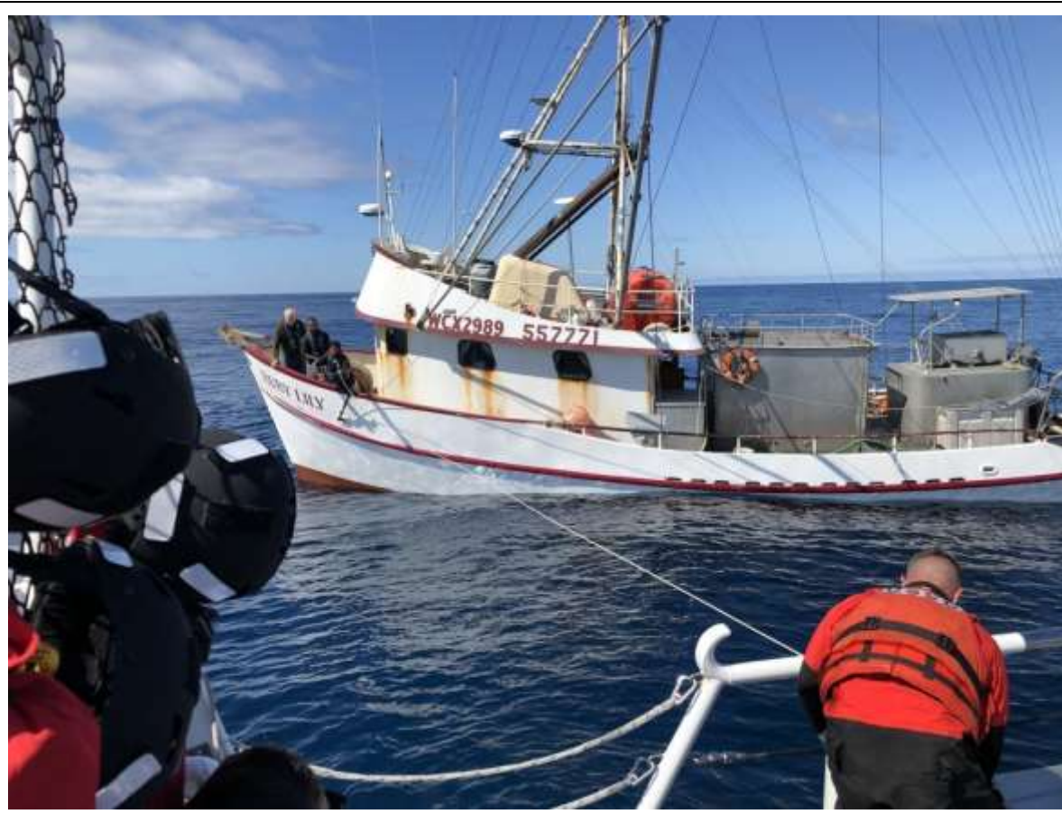
Marathon tow for the USCG to the Central Oregon Coast last week.

Halibut & Bottomfish Seasons NEWPORT, Ore.—ODFW will host a series of public meetings the