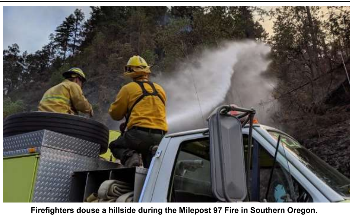
Firefighters douse a hillside during the Milepost 97 Fire in Southern Oregon.

June 13th, nearly a third of this crew had never sailed before on Steadfast — a true testament to the emphasis we put on standards and training." The fight against drug cartels in the Eastern Pacific Ocean requires unity of effort in all phases from detection, monitoring and interdictions, to criminal prosecutions by U.S. Attorneys in districts across the nation. The Coast Guard increased U.S. and allied presence in the Eastern Pacific Ocean and Caribbean Basin, which are known drug transit zones off of Central and South America, as part of its Western Hemisphere Strategy. During at-sea interdictions, a suspect vessel is initially detected and monitored by allied, military or law enforcement personnel coordinated by Joint Interagency Task Force-South based in Key West, Florida. The law enforcement phase of counter-smuggling operations in the Eastern Pacific is conducted under the authority of the 11th Coast Guard District, headquartered in Alameda. Steadfast's missions include homeland security, search and rescue, marine environmental response, recreational boating safety, port safety and security, and law enforcement including: alien migrant interdiction, pollution prevention, marine sanctuary protection, drug interdiction and fisheries enforcement.