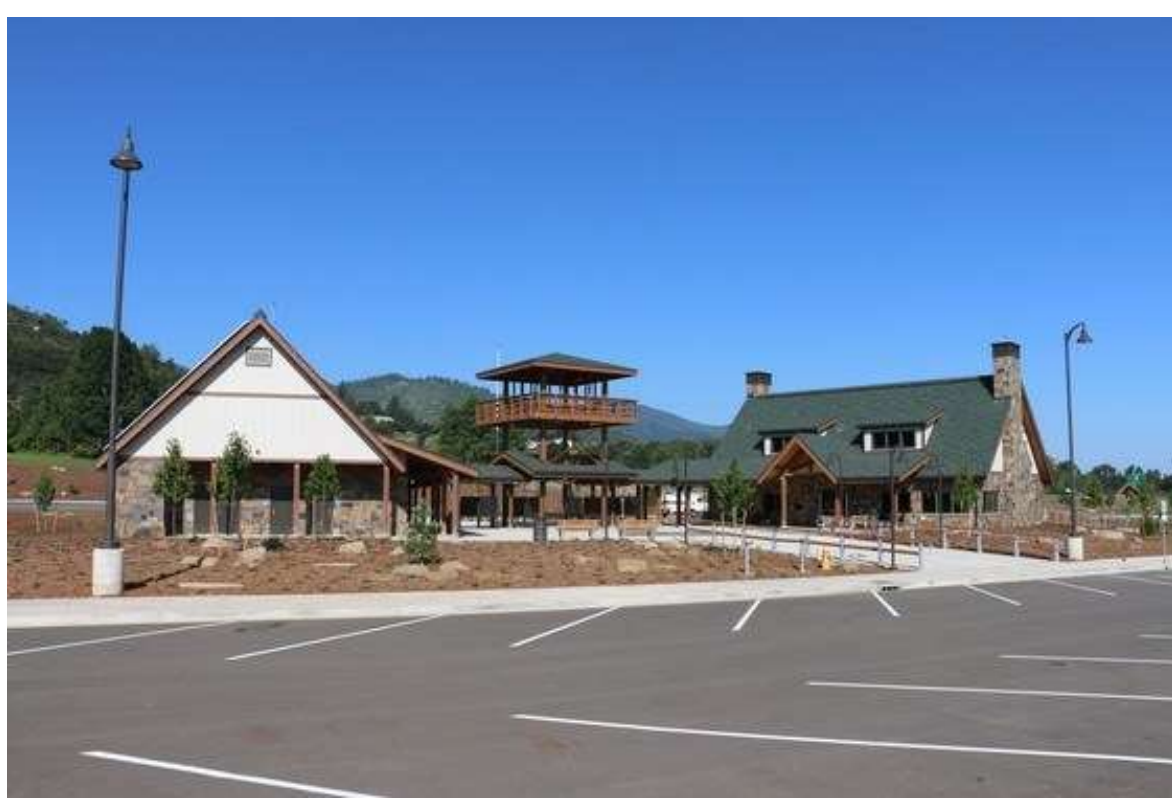
Visitors traveling north on I-5 from California will enjoy a new Welcome Center near Ashland.

ASHLAND – The welcome mat rolled out this morning for the first northbound visitors at the new I-5 Siskiyou Rest Area, south of Ash-