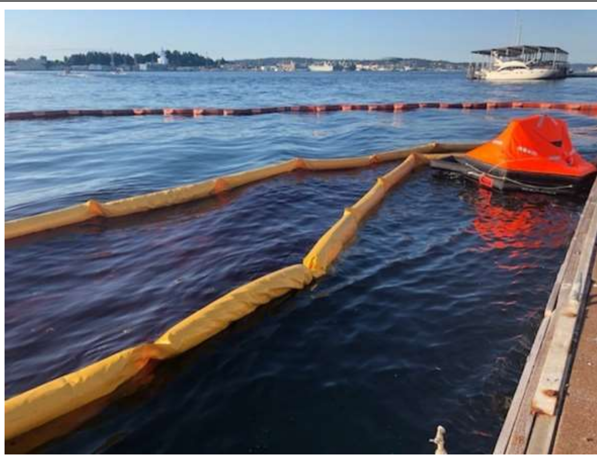
SEATTLE --- Coast Guard pollution responders responded to a report of a tug that sank at the Port Orchard Railway Marina in Port Townsend, Washington. The vessel sinking reportedly caused a dock to overturn that resulted in damage to a nearby vessel. The Coast Guard worked closely with the Navy, the National Oceanic and Atmospheric Administration, Washington State Department of Ecology and local contractors to protect the environment and mitigate potential impacts from pollution.