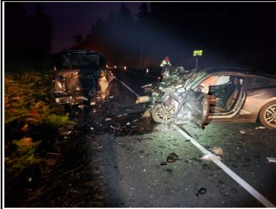
A Rockaway Beach male was killed in this accident on Hwy. 101.

The Oregon Department of Public Safety Standards and Training (DPSST) is pleased to announce the graduation of its 391st Basic Police Class. The Basic Police Class is 16-weeks in length and includes dozens of training areas including survival skills, firearms, emergency vehicle operations, ethics, cultural diversity, problem solving, community policing, elder abuse, drug recognition, and dozens of other subjects. Basic Police