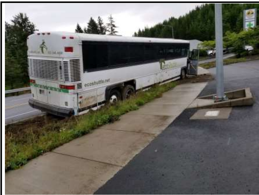
Charter bus driver faces DUII charge after crashing this bus on the North Oregon Coast while transporting National Guard members.