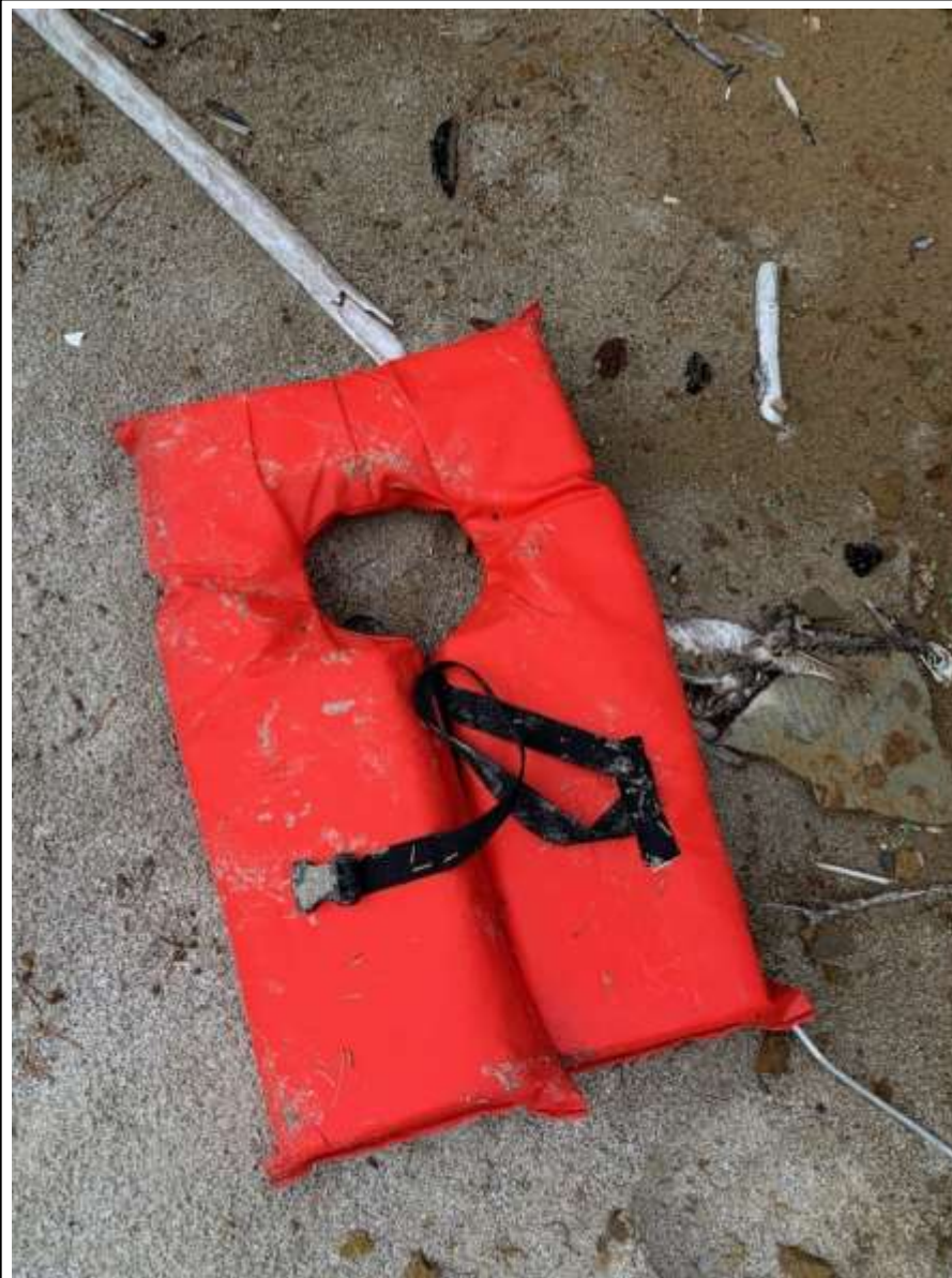
A life jacket from the sailing vessel Kiwanda was found during Coast Guard search efforts by personnel aboard an MH-65 Dolphin helicopter, 47-foot Motor Lifeboat and shoreside responders, Sept. 29, 2019. The search for the man aboard the capsized sailing vessel has been suspended by the Coast Guard.

NORTH BEND, Ore. — A Coast Guard aircrew hoisted an injured man Saturday afternoon, Sept. 21, off Bone Mountain. An MH-65 Dolphin helicopter aircrew from Coast Guard Sector North Bend