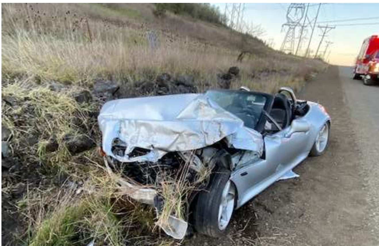
Fatal accident on Hwy. 138E, milepost 8.