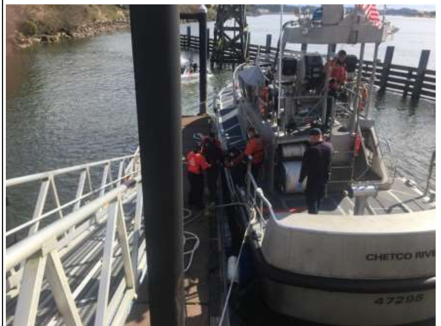
A 47-foot Motor Lifeboat crew from Coast Guard Station Siuslaw River in Florence, Oregon, returns to their dock after they medically evacuated a 55-year-old man off a recreational vessel 5 miles southwest of the Siuslaw River entrance, March 15, 2020. The man reportedly suffered symptoms related to a stroke and was transferred to Peace Harbor Hospital for further care.