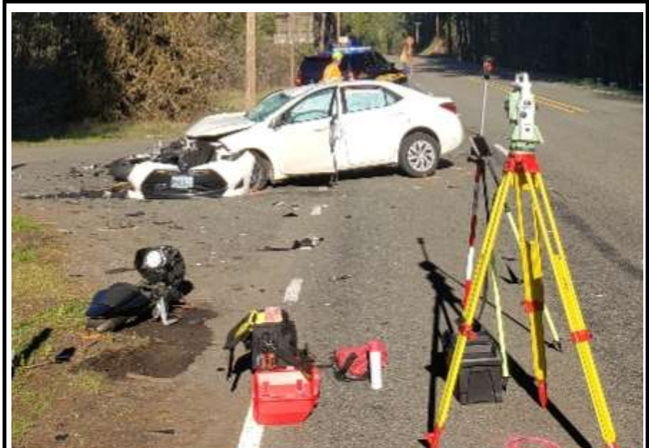
Fatal accident on Hwy. 138E, milepost 28 near Glide.