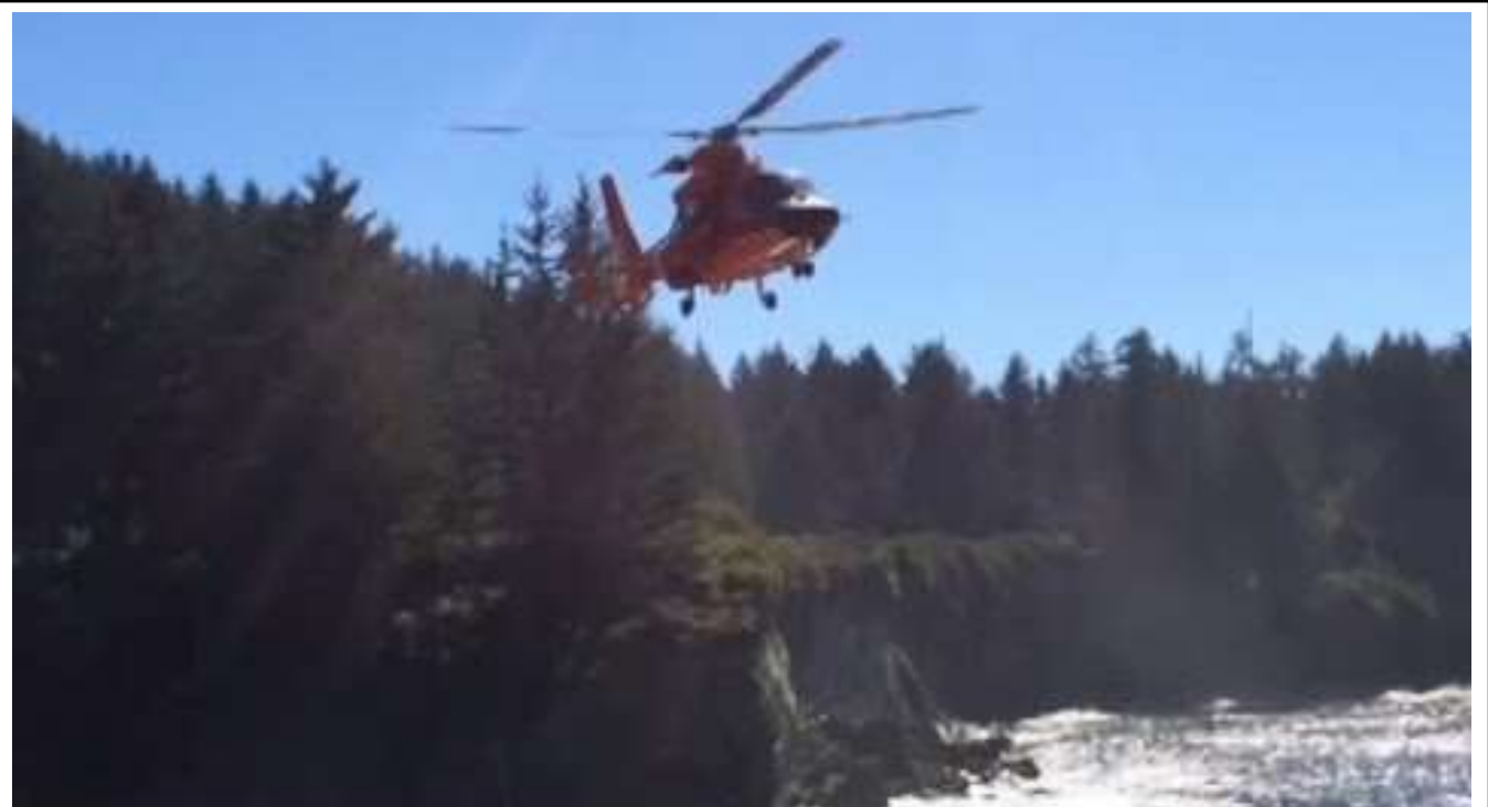
A USCG helicopter flies over Norton Gulch near Shore Acres.

CCSO release - On May 31st at about 08:01 P.M. the Coos County Sheriff's Office received a report of an accident at Norton Gulch off of Cape Arago Hwy. The report stated a male subject was climbing on the rocks when he slipped and fell, striking his head. Witness stated the male subject was observed in and out of consciousness floating in the ocean. The Coos County Sheriff's Office arrived and contacted witness who stated they lost sight of the male prior to Sheriff's Office arrival. The U.S. Coast Guard was notified as well as units from Charleston, North Bend, and Coos Bay Fire Departments. The U.S. Coast Guard searched the area with helicopter, but was not successful. A Coast Guard ship continued the search throughout the