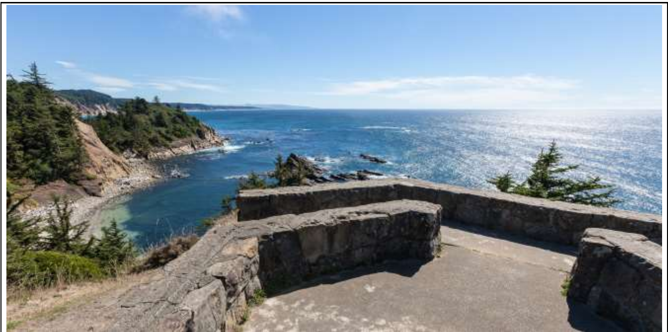
Cape Arago State Park west of Charleston attracts many to its trails.

CCSO release - On June 11th, 2020, at approximately 1201 PM, the Coos County Sheriff’s Office received a 9-1-1 call with the report of a mother and eighteen year old son had slipped and fallen off the ledge of the cliff at the Cape Arago State Park at the end of Cape Arago Highway. The caller reported the eighteen year old son had fallen to the bottom of the cliff and appeared injured, while the mother was hanging onto the cliff trying not to fall to the bottom as well. Units with the Charleston Fire Department, Oregon State Police, Coos County Sheriff’s Office, Bay Cities Ambulance Oregon State Parks and the Coos Bay/North Bend Fire Department Rope Rescue team responded to the scene. The United State Coast Guard (USCG) sent two helicopters and other resources to assist with retrieving