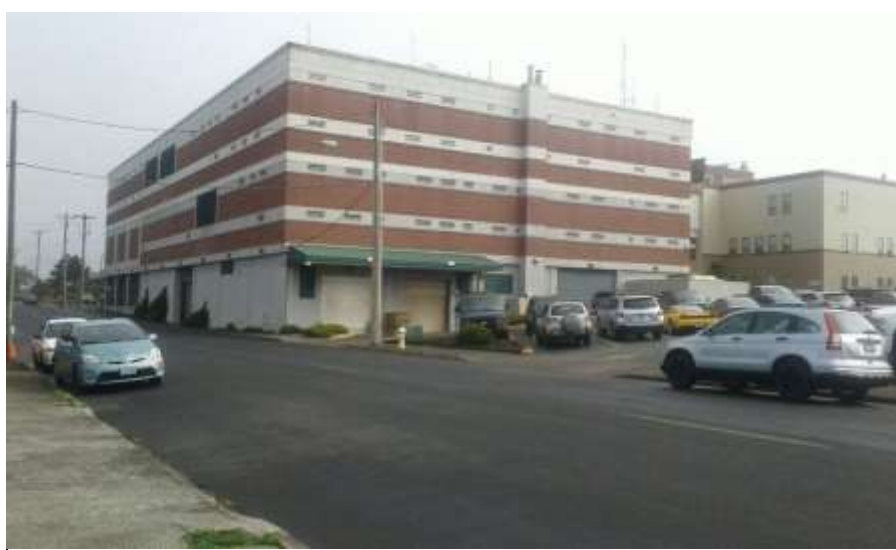
Lincoln County Jail at Newport.

Advertising Information available at: (541) 290-9365